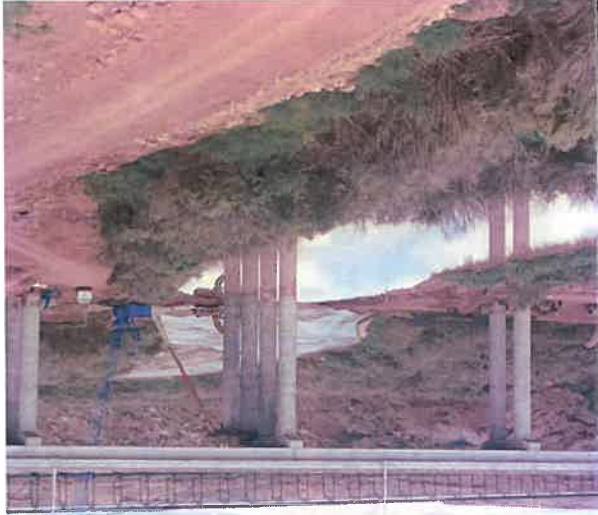
US-89, Little Colorado River Bridge Project

Handwritten note: Junction to BIA Rte 6330 to Rte 6330 US 89A cut & reconnection